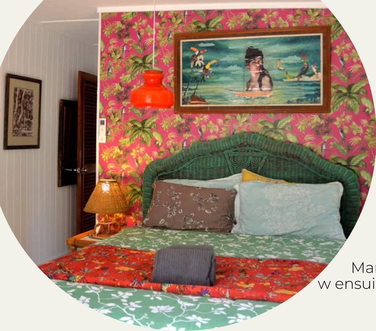
Mango w ensuite $1,980