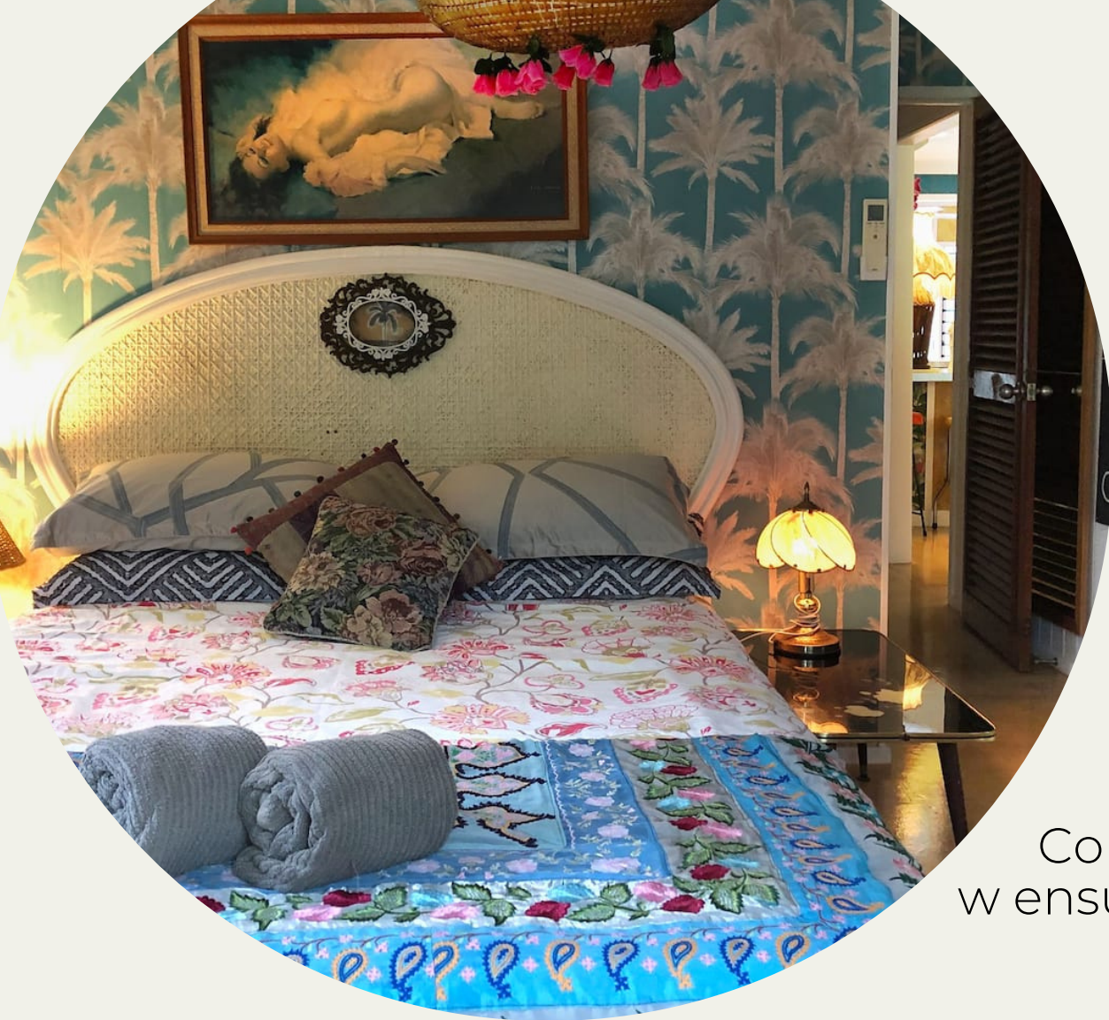
Coral Sea w ensuite $1,980