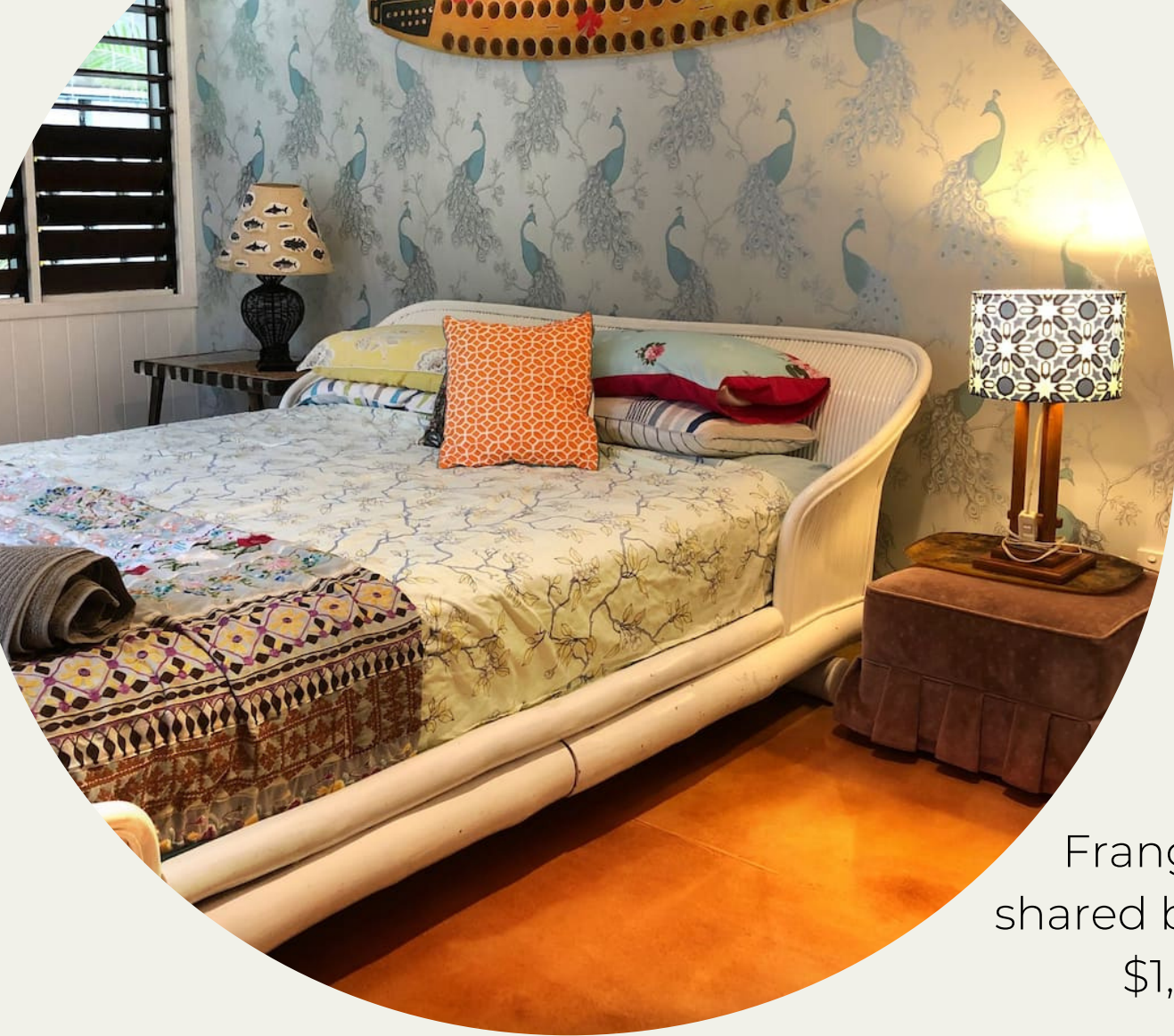
Frangipani shared bathroom $1,780