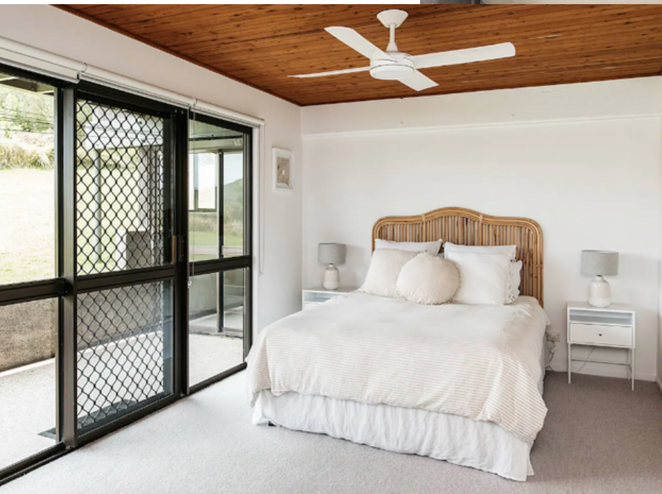
QUEEN BEDROOM 5 OWN BATHROOM