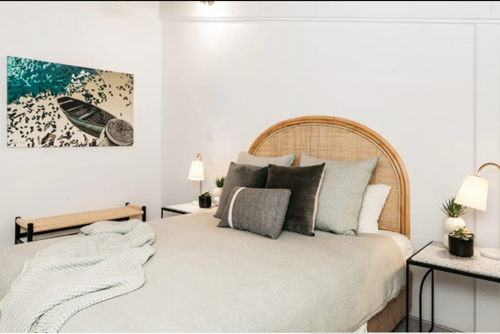
QUEEN BEDROOM 3 SHARED BATHROOM