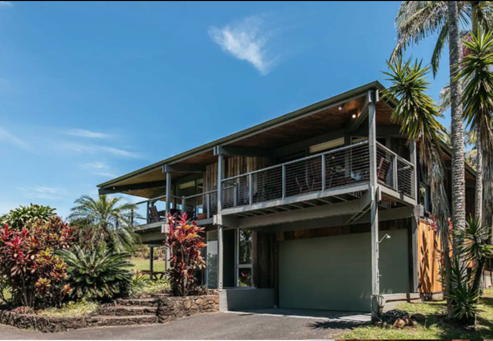
FRONT VIEW OF HOUSE